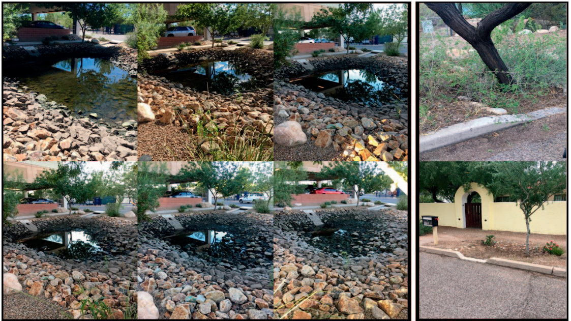
Fig. 2. Images of the green stormwater infrastructure sampled in 2018: 6 days post-rain event of the basin that retained water and produced mosquito larvae (left 6 images) and 2 examples of curb cuts that did not retain water (right 2 images).

mentation (Staddon et al. 2018). Successful implementation of an urban greening initiative requires collective responsibility by all concerned parties (Paul et al. 2014).