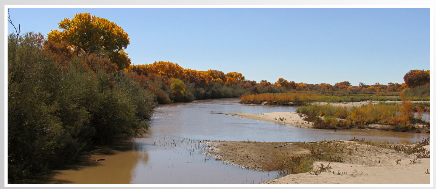
PICTURED: RIO GRANDE IN NEW MEXICO.

Grande watershed may exceed those of recent years. That could mean greater challenges for water management than those the region has faced.