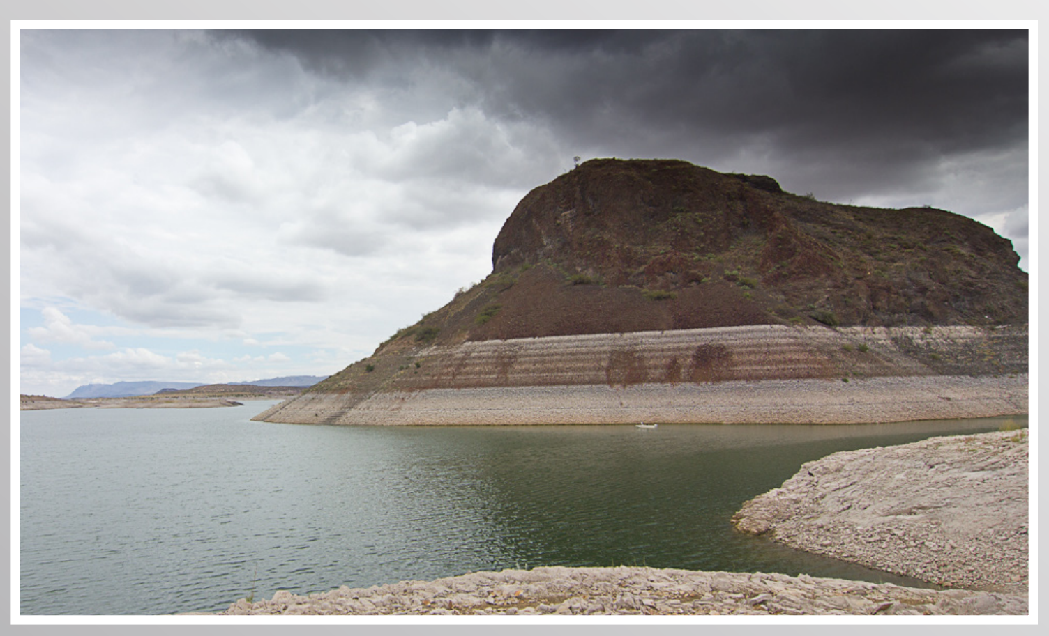
PICTURED: BLEACHED ROCKS THAT LINE ELEPHANT BUTTE, THE NAMESAKE FOR ELEPHANT BUTTE RESERVOIR IN SOUTHERN NEW MEXICO, ARE A VISUAL REMINDER THAT WATER STORES ALL NEARLY EXHAUSTED. IN EARLY JULY WHEN THIS PHOTO WAS TAKEN, ELEPHANT BUTTE RESERVOIR CONTAINED ONLY ABOUT 12 PERCENT OF CAPACITY; STORAGE IS CURRENTLY EVEN LESS.

"When we have to pump nearly all of our water, for a pecan farmer it adds 10 to 15 percent to our normal expenditures," Daviet said.