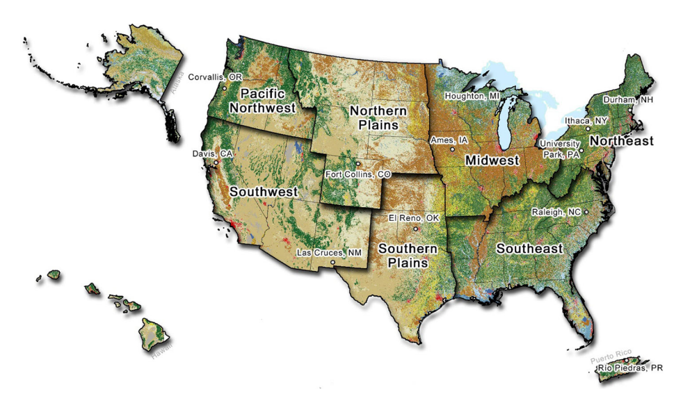
Fig. 1 The seven U.S. Department of Agriculture Climate Hub Regions, with subsidiary hubs located in Davis, California, Rio Piedras, Puerto Rico, and Houghton, Michigan. Hawaii and the USA-affiliated islands west are part of the Southwest Hub. Alaska is part of the Pacific Northwest Hub

In the USA, Cooperative Extension Service (CES) is often the primary source for agricultural information (Cash 2001). CES was created over 100 years ago to serve as the interface between land grant universities and stakeholders. While CES provides valuable support and information through county agents across the country, farmers in certain regions may be more likely to seek information from private agricultural advisors and consultants than CES (Prokopy et al. 2015). Since private agricultural advisors and consultants typically trust CES as a source of information and can also serve as a conduit of climate change information to farmers, foresters, and ranchers, CES is both an important user of weather and climate information and supporter of many weather and climate sensitive sectors (Brugger and Crimmins 2014). Whether CES works directly with farmers, foresters, and ranchers or through advisors, CES