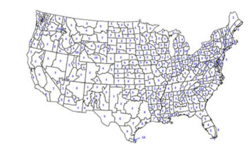
Figure 1a. The 344 climate divisions currently in use for the conterminous United States. For more information visit http://www.cdc.noaa.gov/USclimate/USclimdivs.html.

Although the CD data provide a long, consistent, and gap-free record, climatologists have long questioned the assumption that the simple averaging of COOP stations into CDs is optimal for depicting regional climate, especially precipitation. To examine this issue, we correlated individual COOP station data with divisional averages (Figure 1b). Results show that much of the high elevation Interior West, especially along the Rocky Mountains down into New Mexico, is not well represented by divisional averages. During the winter